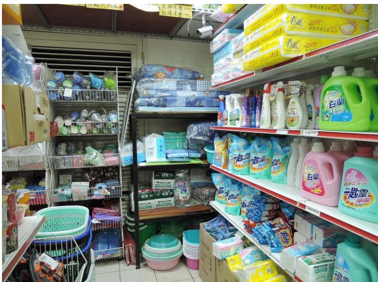
Grocery shop and cafeteria on B1 of ZihCiang Dorm 9